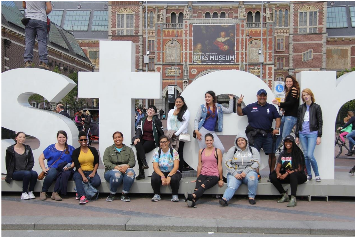
Summer 2017 Students in front of iconic I Amsterdam sign