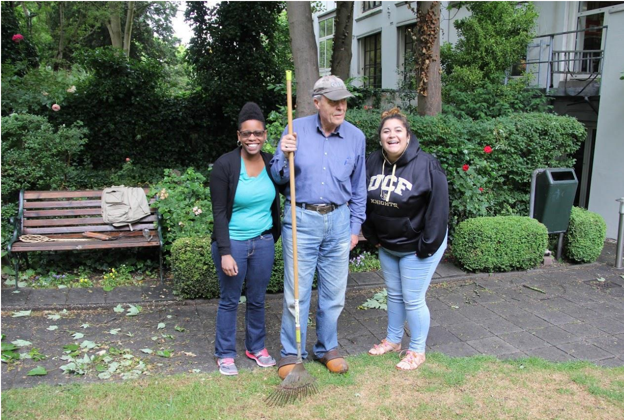
Summer 2017 students hanging with a local in his Dutch gardening shoes