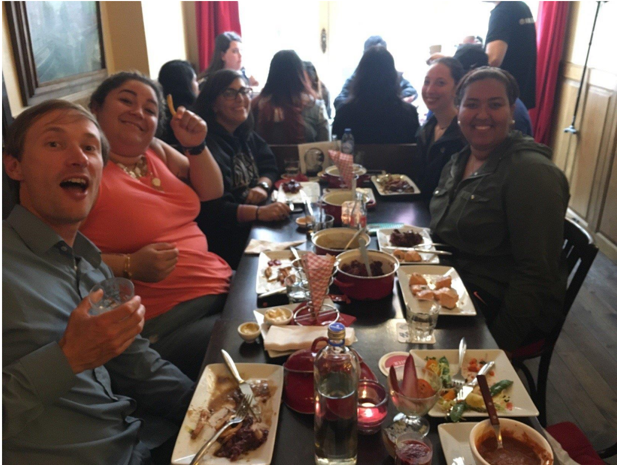
Summer 2017 students enjoying traditional Dutch fare