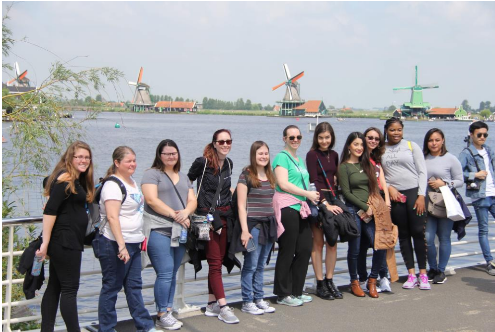
Summer 2018 students enjoying a day in the Dutch countryside!