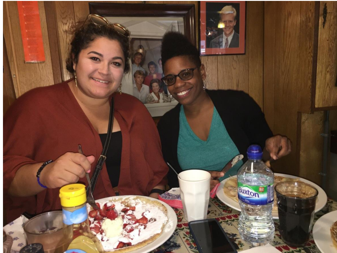
Summer 2017 students having traditional Dutch pancakes